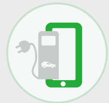
OTA Remote Access