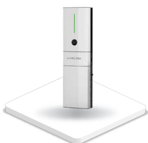
All-in-one Energy Storage System