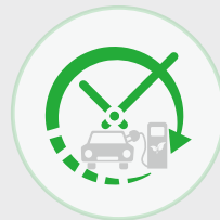
Time of Use Schedule